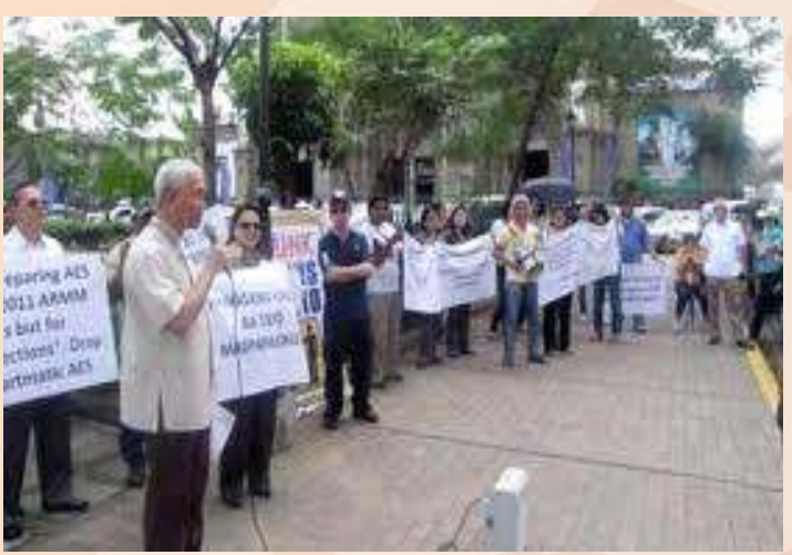
Poll watchers picket Comelec March 2011