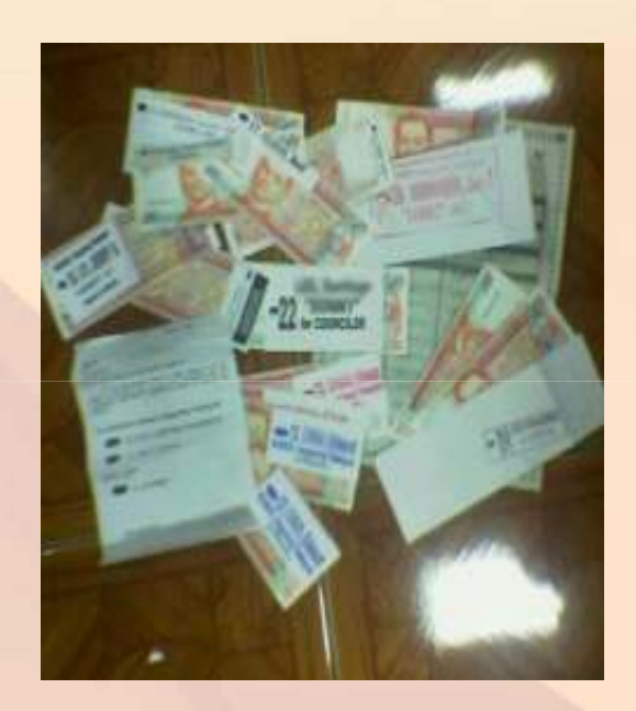
Vote buying in Catbalogan, Leyte